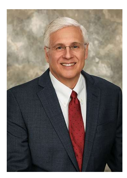
Great Careers Begin Here!

Lanier Technical College, a unit of the Technical College System of Georgia, serves as the foremost workforce development resource for Banks, Barrow, Dawson, Forsyth, Hall, Jackson, and Lumpkin counties. Founded in 1964, Lanier Tech's mission of " workforce development " has always remained constant.